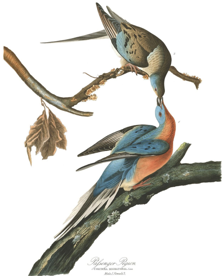
Passenger Pigeon COLUMBA MIGRATORIA , Linn. Male, 1. Female, 2.