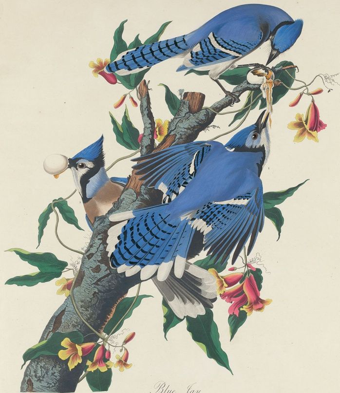
Blue Jay. CORYVUS CRISTATUS. Male, 1. Female, 2, 3.