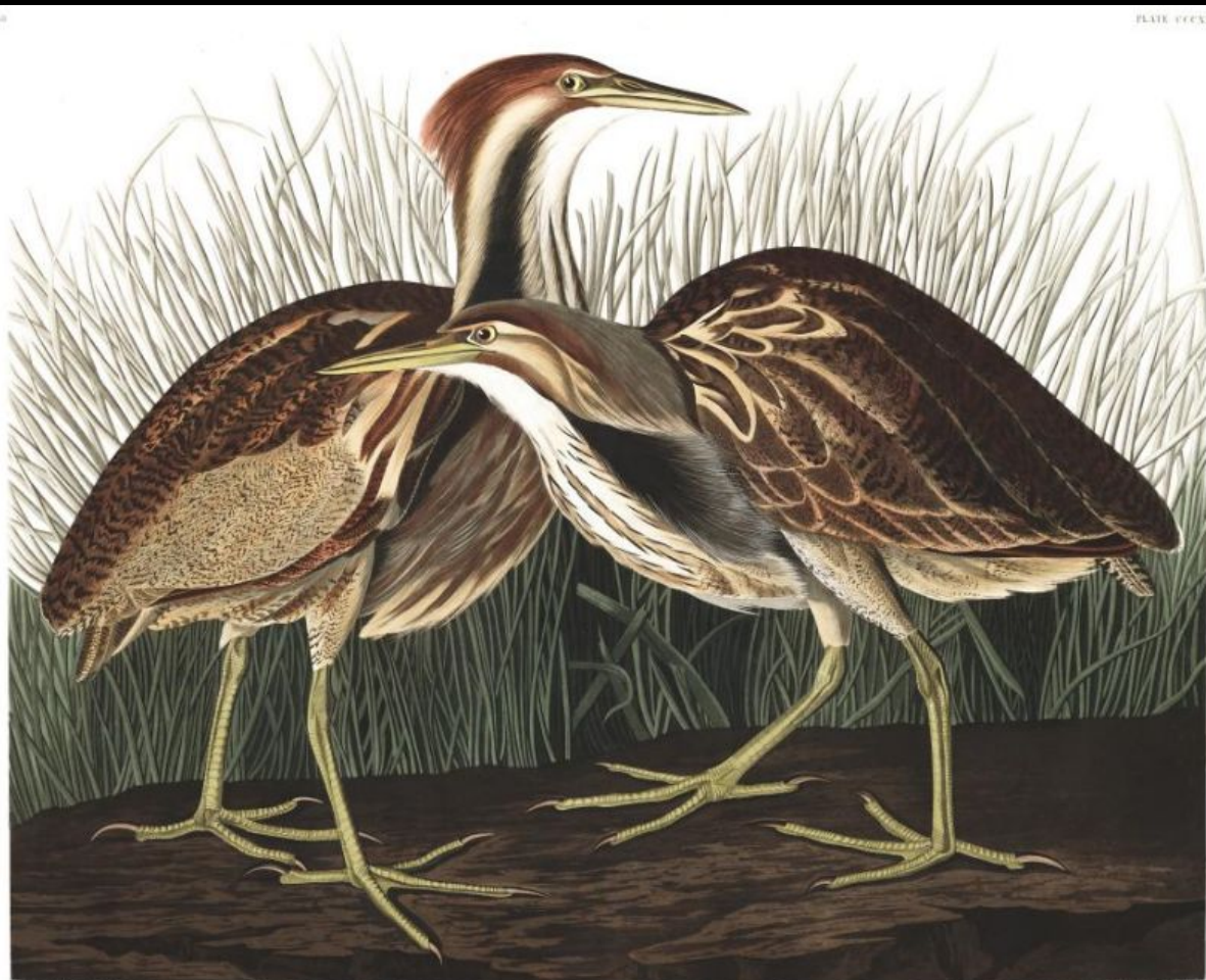
American Bittern ARDEA HIBOL