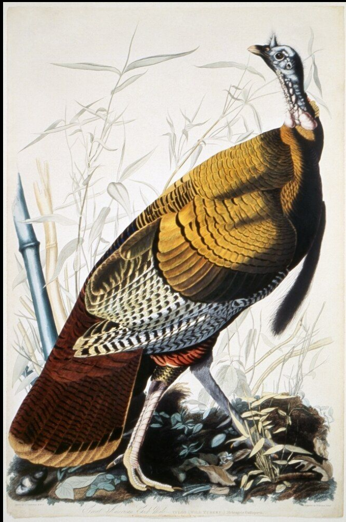
Meleagris gallopavo Wild Turkey - Straggelbalken