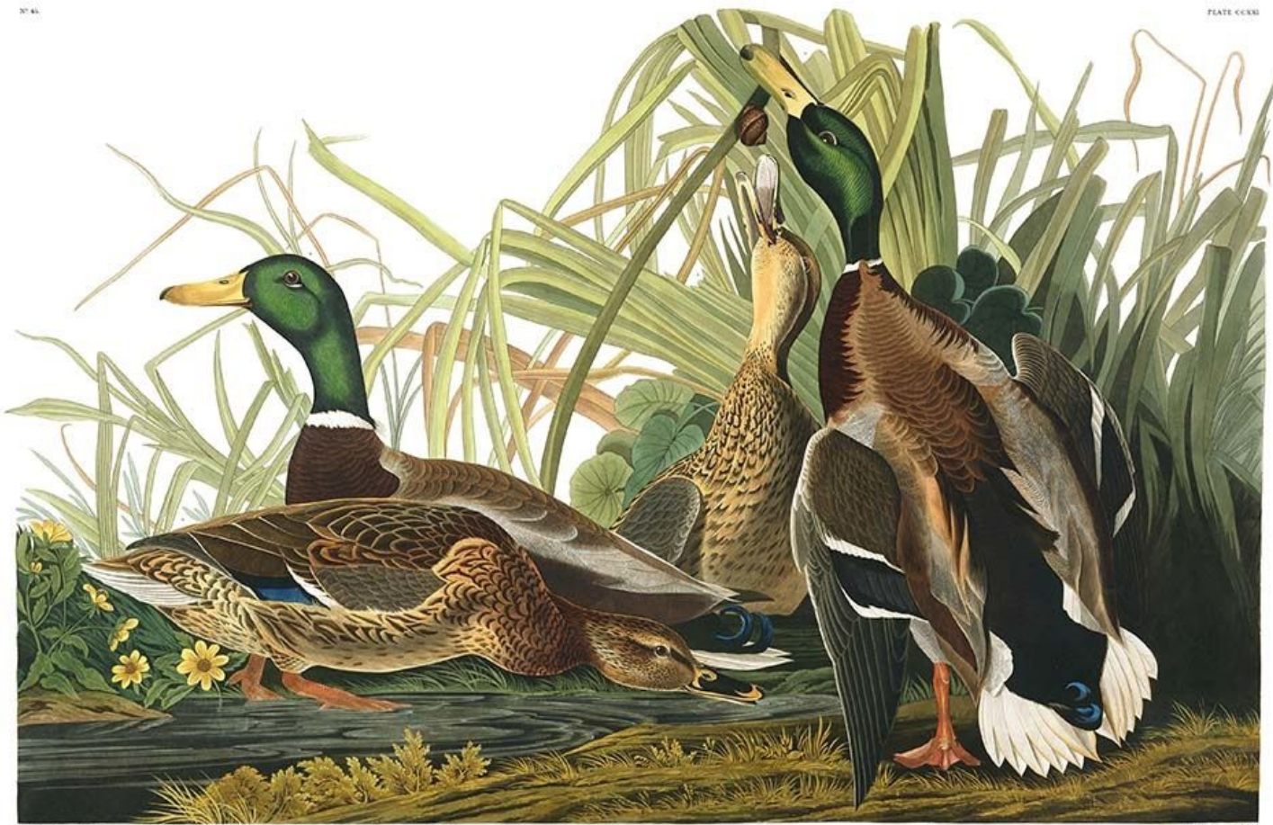
Mallard Duck. ANAS BOSCHUANI. LINNÆUS.