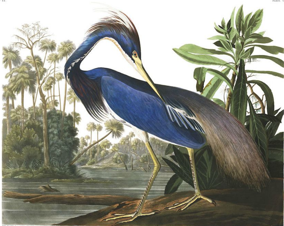
Louisiana Heron. ARDEA LUDOVICIANA. W. Male adult.