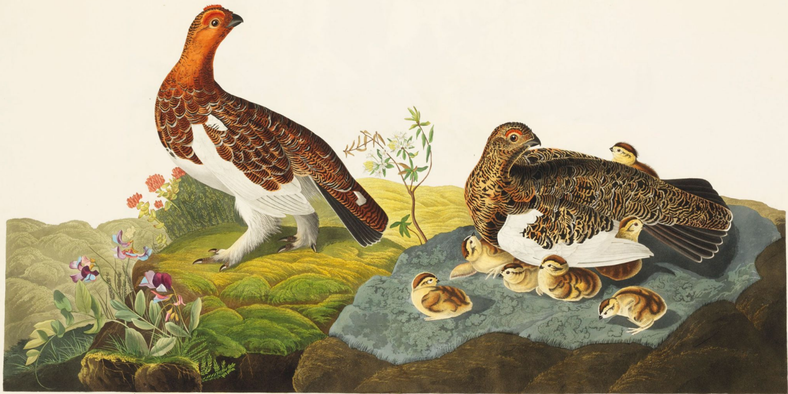
Willow Grouse or Large Ptarmigan.