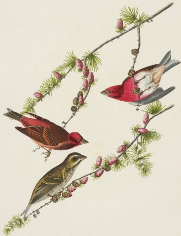
Purple Finch FRINGILLA PURPUREA, Amer. Male, ♀ Female, ♀ Red Hawk - Larus americanus .